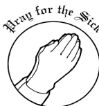
© J. S. Palach Co., Inc.